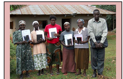
Kima Bible study group receives their Bibles through cost sharing to enhance ownership and to promote self reliance.