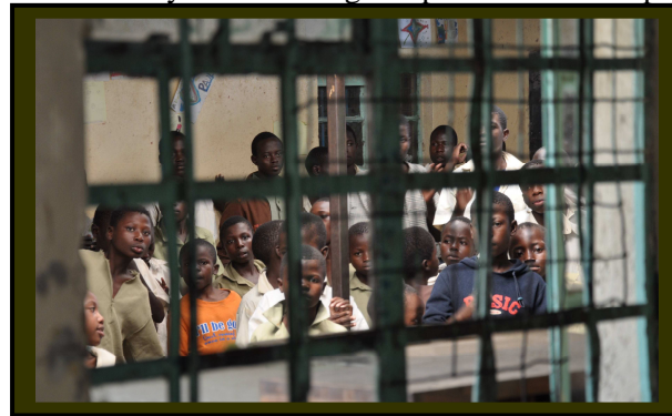
Boys in a Remand Hall in Kisumu

Now imagine yourself a child of 9 or 10 and finding yourself in that same circumstance. Yet more than 170 children in the Kisumu Remand Center (Juvenile Detention) find themselves in exactly that situation. Most are there because they have committed some petty crime or were simply loitering in the wrong place at the wrong time. Sadly, hardened 17 year old criminals are squeezed in with the innocent 10 year old who got separated from his parent in town.