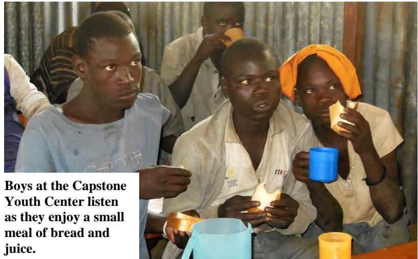
Boys at the Capstone Youth Center listen as they enjoy a small meal of bread and juice.

Outreach and Reconciliation: The vision of Capstone Ministries is the reconciliation of street children with their families. Capstone staff strive to accomplish this by having an ongoing presence on the street, conducting a weekly outreach at the ELCK compound and working together with the Juvenile Detention Center. At every level the staff strives to minister to the spiritual, psychological and emotional needs of the boys with the goal of reconciling them with family and God. In 2013, 39 boys were rescued from the street and reconciled with their families.