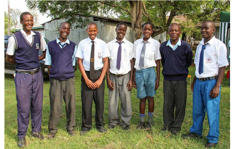
The seven 2013 sponsored high school boys at a mentoring day sponsored by Capstone.

WWOP Every year Capstone coordinates with ELCK local congregations to host the World Weekend of Prayer for Orphans and Vulnerable children. For the second year Rarieda Parish hosted this event. The climax is the Sunday worship service led by the children. More than 300 children attended this