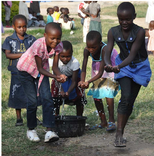
Children engage in a race to carry water in their hands to fill a small coke bottle.

WWOP Every year Capstone coordinates with ELCK local congregations to host the World Weekend of Prayer for Orphans and Vulnerable children. For the second year Rarieda Parish hosted this event. The climax is the Sunday worship service led by the children. More than 300 children attended this