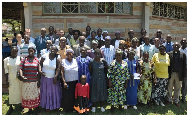
All 10 Bible Study Groups gathered for the 2 nd joint gathering of the groups in August at the Kisumu ELCK Lutheran Cathedral.