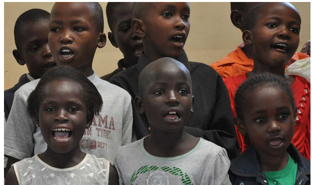
Kisumu Cathedral choir raised the roof with their rousing traditional spiritual songs.