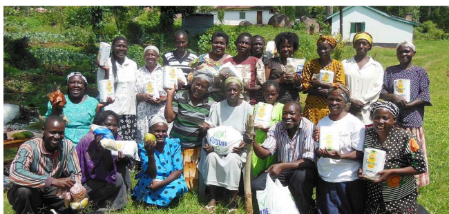
The wildly successful Maseno HIV+ women's group proudly display their Christmas bonuses.

Moringa Groups Capstone works with 3 groups in the rural area to grow moringa. The expanding income generating program is helping the rural poor to earn an income and is supplementing the local budget of Capstone as well.