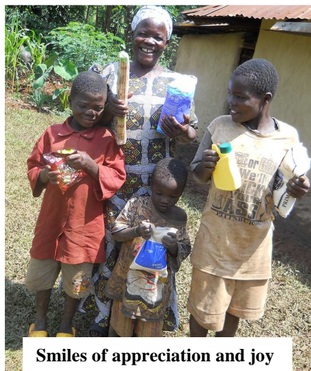
Smiles of appreciation and joy

Christmas Gifts Once a year Capstone provides a Christmas gift to some of the poorest of the families with a reconciled son. Many of these families shed tears when our staff shared the modest package of food stuffs with them.