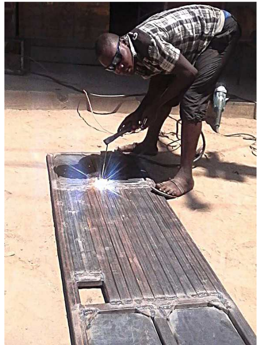
Above: Briton with a finished metal security window he fabricated. Right: Briton welds a metal door.