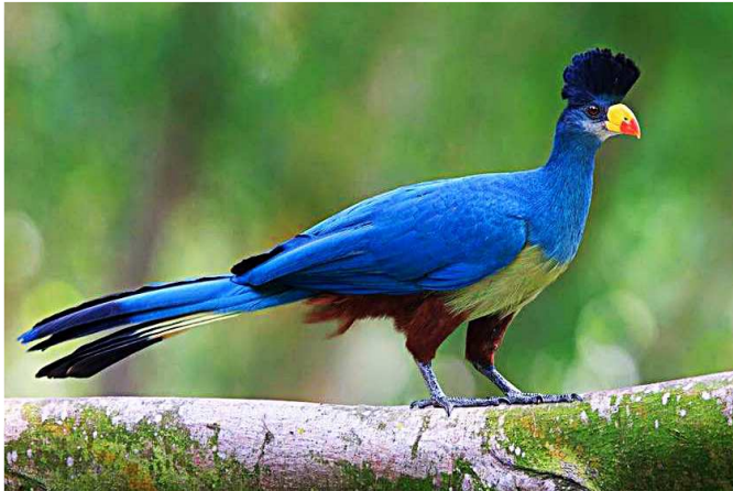
The famed Great Blue Turaco from Kakamega Rain Forest