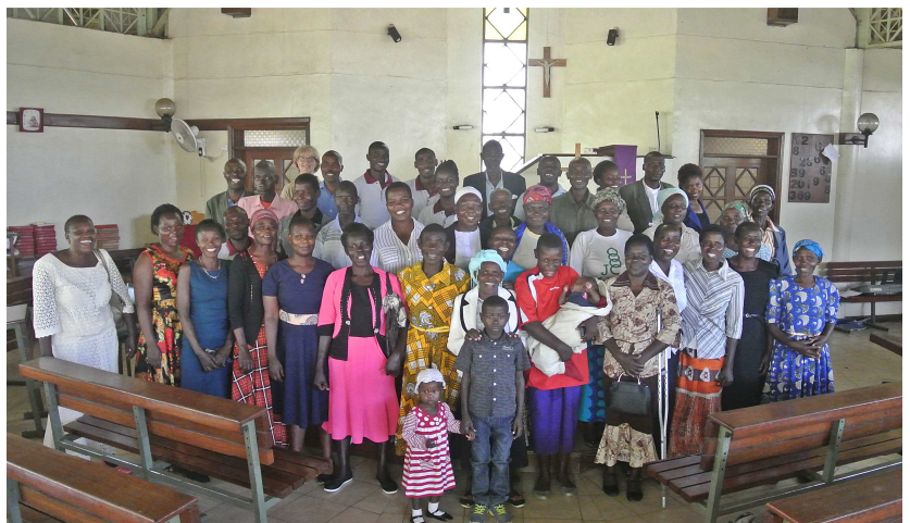
Joint Bible Study Gathering at ELCK Cathedral in Kisumu, April 17

Human beings have developed defense mechanisms against the Word, much like the armor of a soldier. We rationalize, deny, and deflect. This is a common trait of people all over the world. But the Word remains powerful and effective in addressing man's greatest need: reconciliation with God! Like a skilled surgeon wielding a scalpel; his cuts both wound and bring healing by exposing and removing the hidden cancer within, the Word does the same by exposing the sin beneath the surface, restoring life and bringing hope.