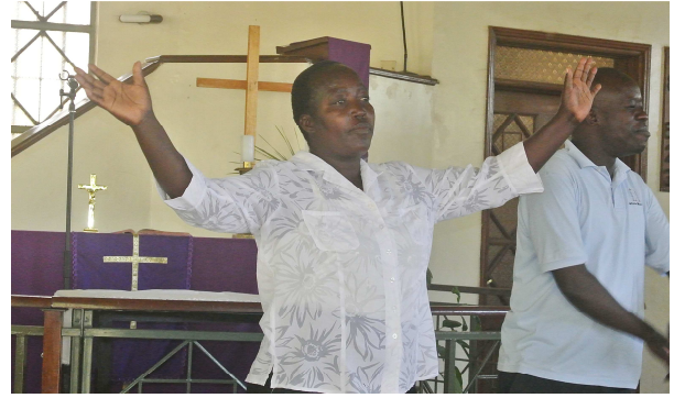
A parent shares her dramatic testimony of reconciliation with her son, giving praise to God

Every other year, the groups gather together for a morning of reflection on the Word and how it has changed their lives. On April 17, many of the members of these 13 groups came together at the ELCK Lake Diocese Cathedral in Kisumu. It is a time of learning, testimonies, prayer and fellowship that enhances and strengthens the faith of all.