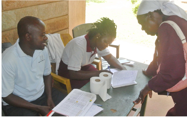
A member registers upon arrival

This is the true nature of mission work. It is the use of the Word to reconcile and restore fallen men, women and children with their Creator and Redeemer. It is part and parcel of the work of Capstone Ministries and happens every single day in all aspects of the work.