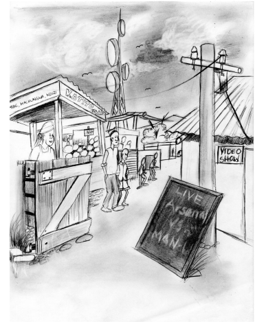
Katito village with video kiosk

Significant challenges then are faced by Timo and his family. (Sorry, you will have to read the book to discover for yourself) In the end Timo is reconciled with his family again through the intervention of Capstone Ministries staff. The book chronicles in a very realistic way the process of reconciliation. The story honors the culture and Christian faith of Kenyans. It strives to avoid any sense of pity or condescension that is all too prevalent in American stories of African life. The book elevates the concepts of forgiveness and