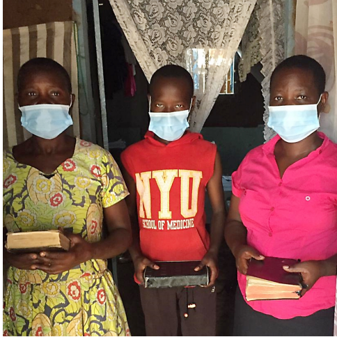
Kisumu Bible Study Group at most recent gathering

our pastors Isaiah and Zadok have been meeting with the parents of reconciled children and leading them to Jesus. Each visit that our staff make on a follow up visit, they share the Word that is specific to their circumstance.