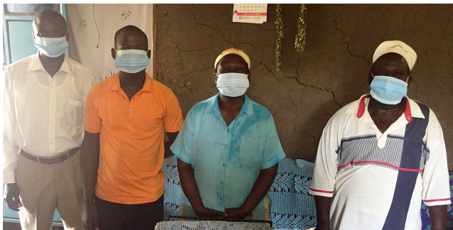
Nyakach Bible Study