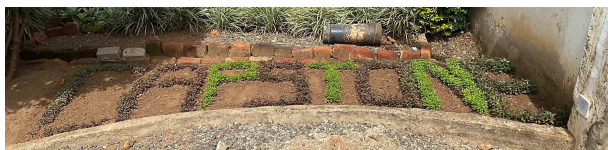
Ground cover spells out C*A*P*S*T*O*N*E as you enter