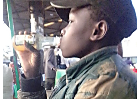
Boy on the street huffing glue: Stark reminder of how much this work is needed