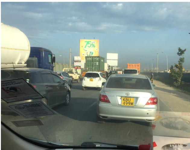
Traffic jams of Nairobi have not changed