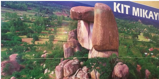
Kisumu baggage terminal