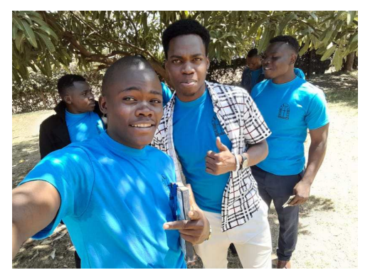
A few selfies are, of course, necessary