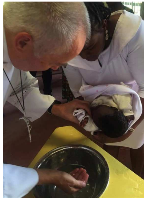
Baptizing the twins