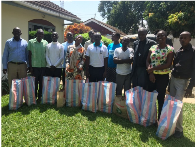
Capstone Staff received their Christmas gifts before going on Christmas leave. They all say, "Thank-you and God bless you."