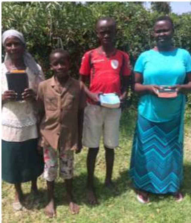
New Bible Study at Katito this year!