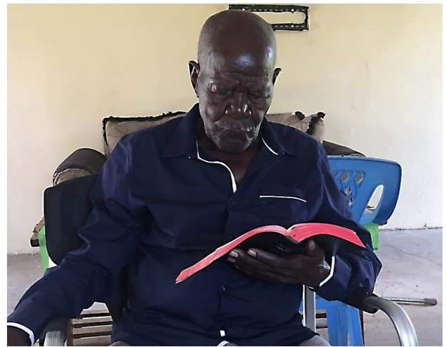
New Bible Study in Muhuroni