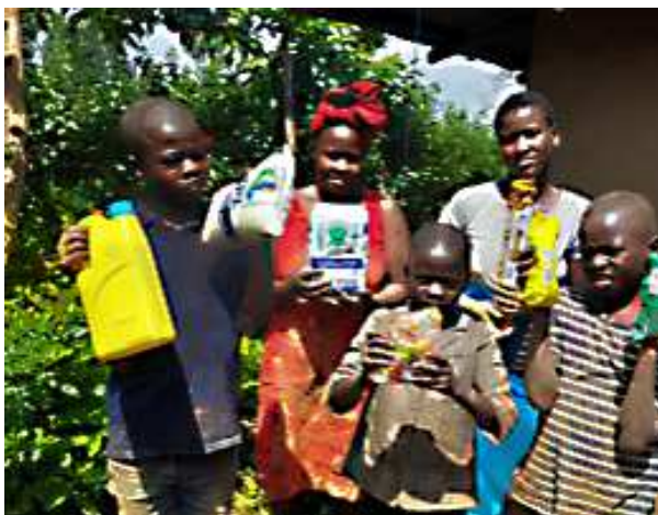
Christmas food packages for needy families.